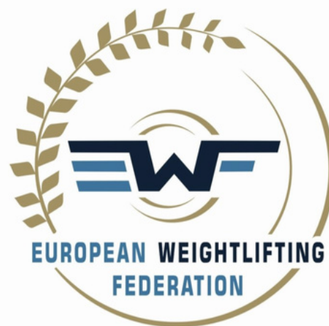
The EWF Executive Board meeting in Poland and the new logo of the European Weightlifting Federation