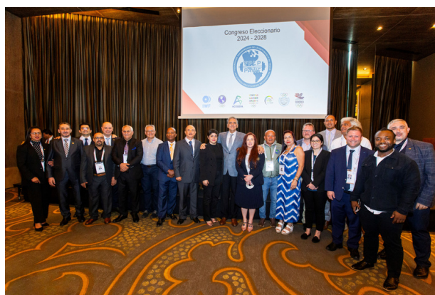
Pan-American representatives with IWF officials during the Congress in Lima (PER)