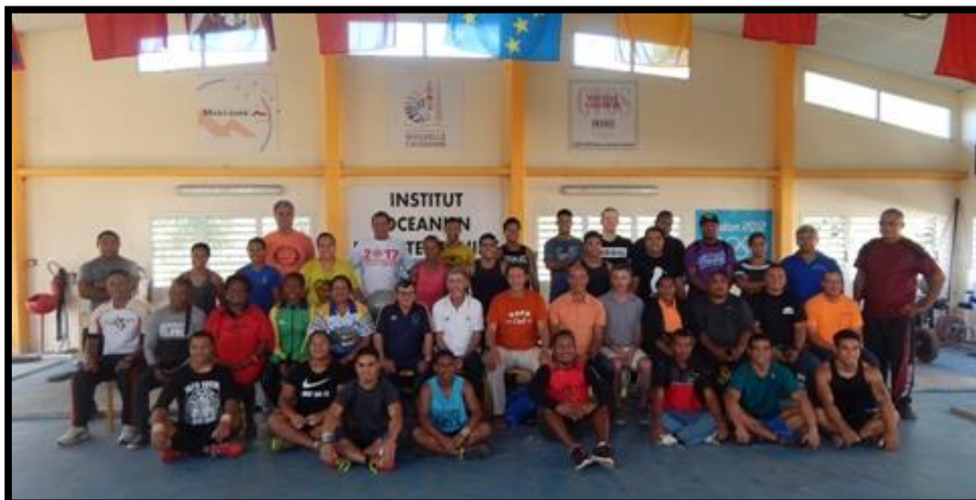
The delegates attending the Training for Oceania Coaches - workshop.