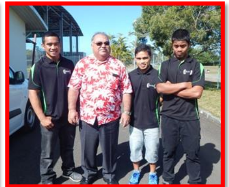
President of Nauru, His Excellency Baron Waqa, with Madam Waqa enjoyed meeting Nauru's lifters residing at the institute.