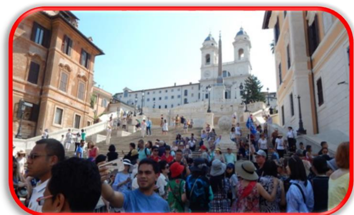
Elson Brechtefeld at Piazza di Spagna (Spanish steps)