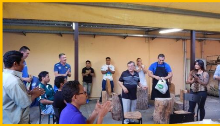
The Army Olympic Sports Centre on the last night of our stay, organised a typical Aussie barbeque.