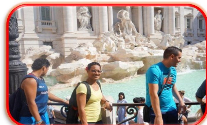
The famous Trevi fountain