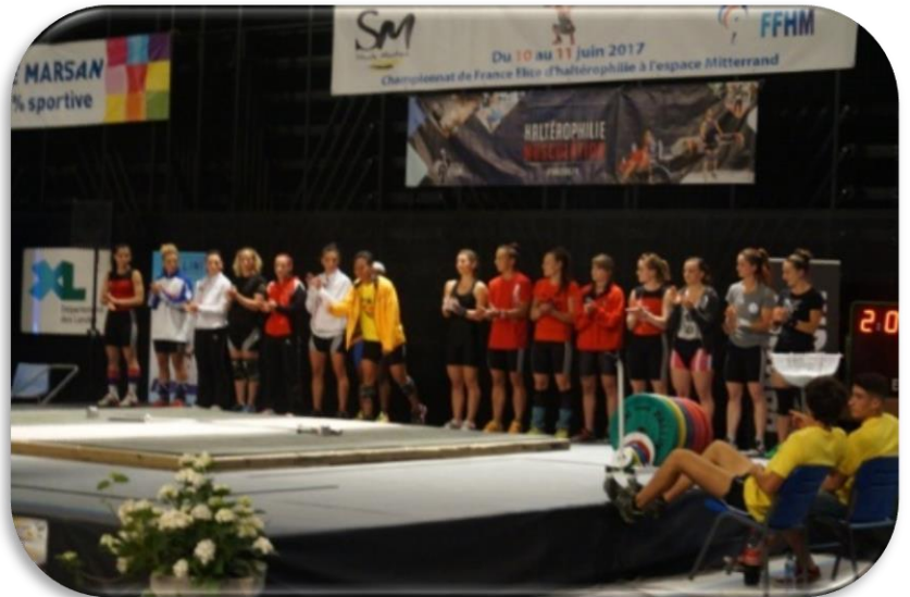
Women first session presentation