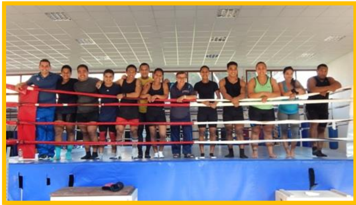
The famous boxing ring that Mohamed Ali won the heavyweight Olympic Gold Medal at the 1960 Rome Olympic Games.