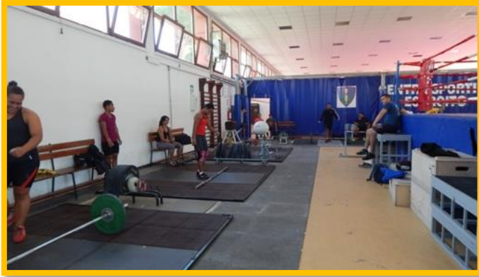
The weightlifting room at the Army Centre