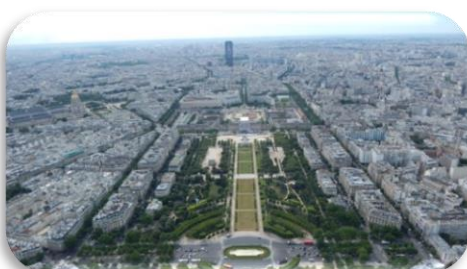
Paris in the daytime.....