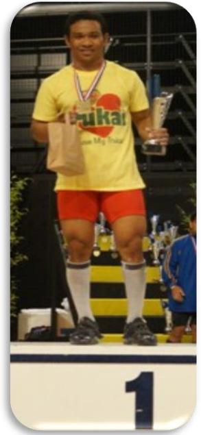
Morea Baru Gold 62Kg Cat.