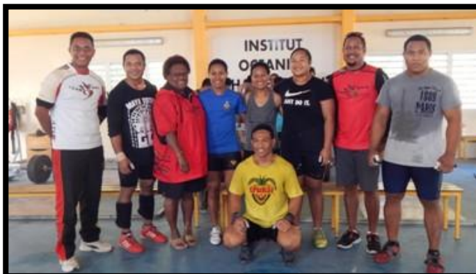
The PNG delegates meet the PNG lifters