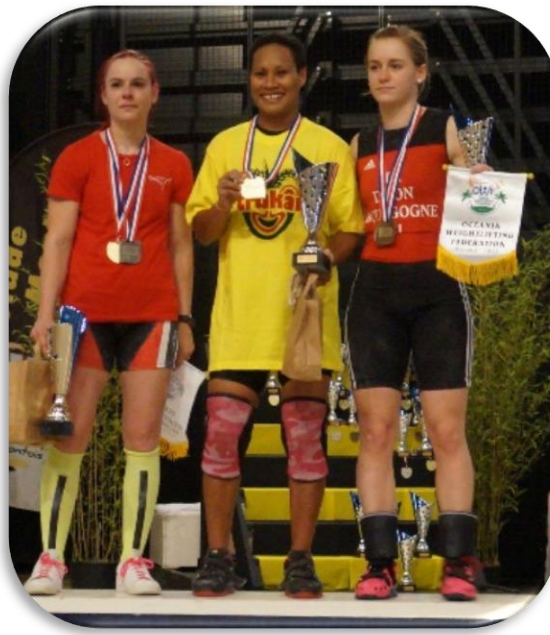
Dika Toua Gold 53Kg Cat.