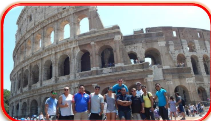
The Institute lifters at the Colosseum