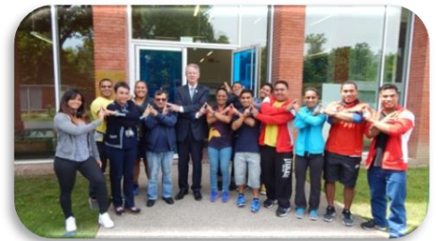
The Co-President of Paris 2024 with all the Institute lifters at INSEP.