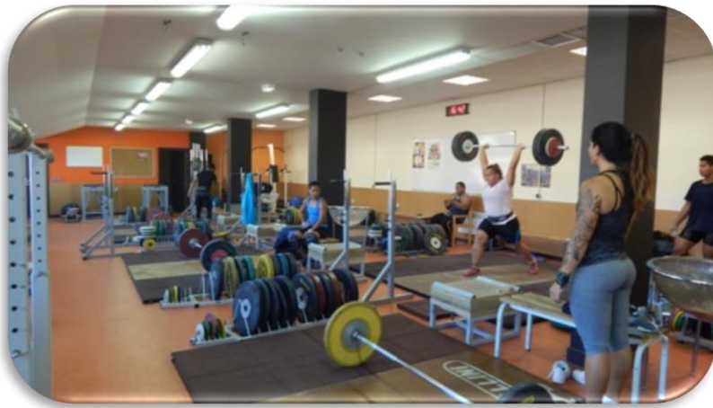
The weightlifting hall at INSEP- Paris