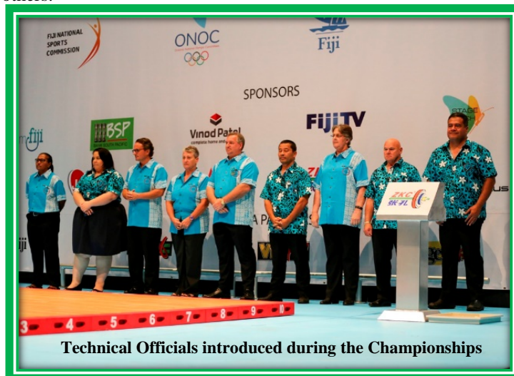
Technical Officials introduced during the Championships