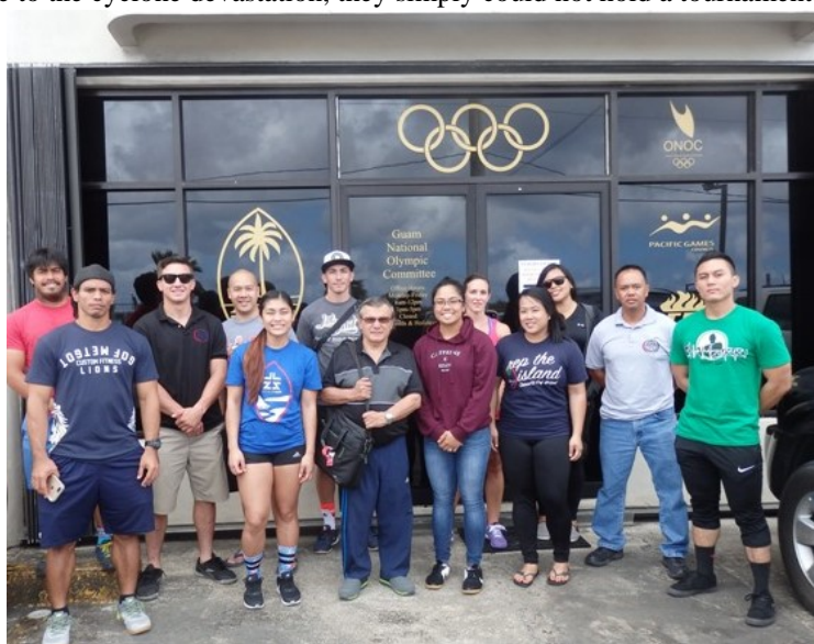
The Guam lifters and officials outside the Guam NOC headquarters.