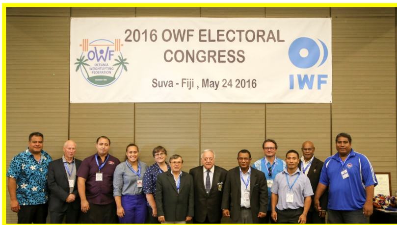
The OWF Executive Board for 2016 - 2020