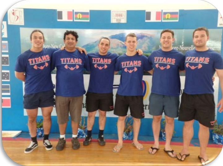
The New South Wales squad competing at the Pacific International