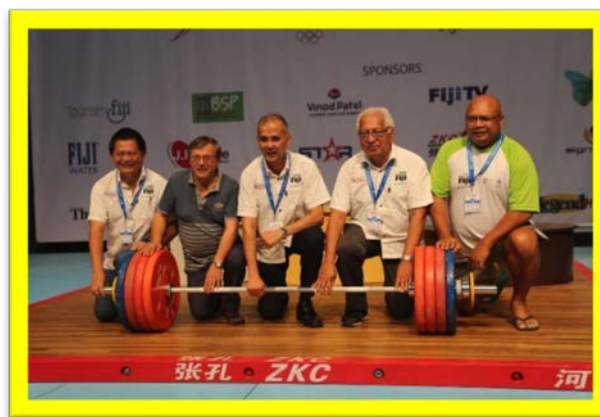
The power behind the Organising Committee