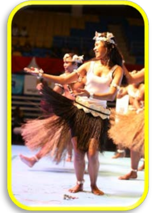
The Opening Ceremony