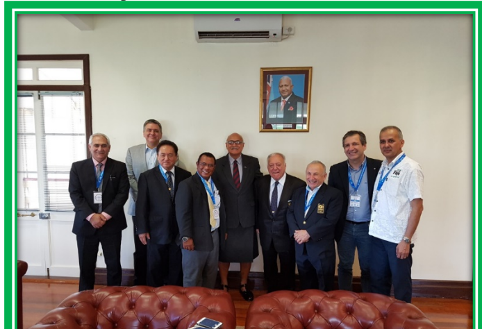
Official courtesy visit by the IWF to the President of the Republic of Fiji , H.E. Major General Jioji Konousi Konrode