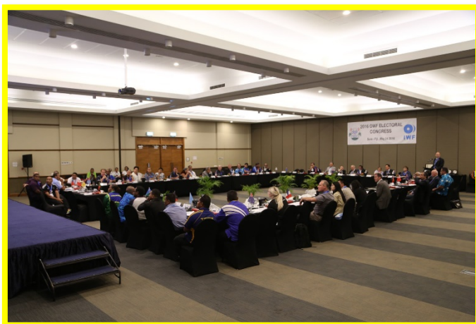
The OWF Electoral Congress in action in Suva