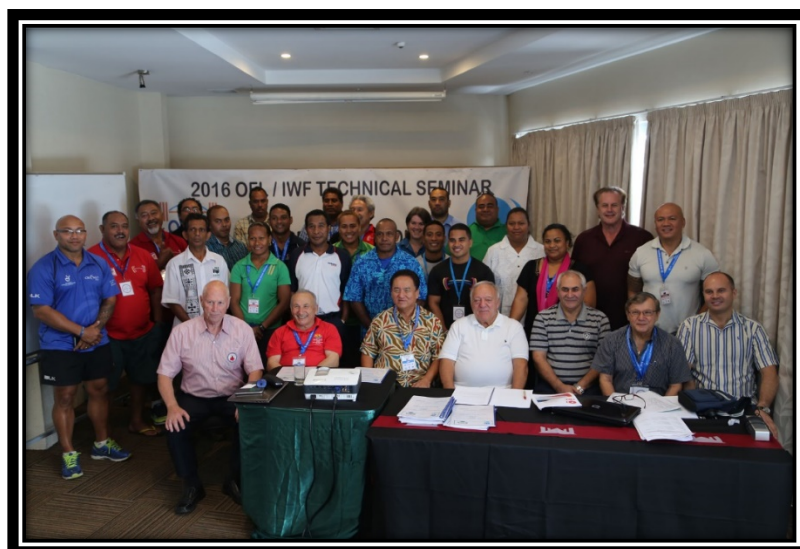
Delegates from 16 countries attended the International Technical Seminar