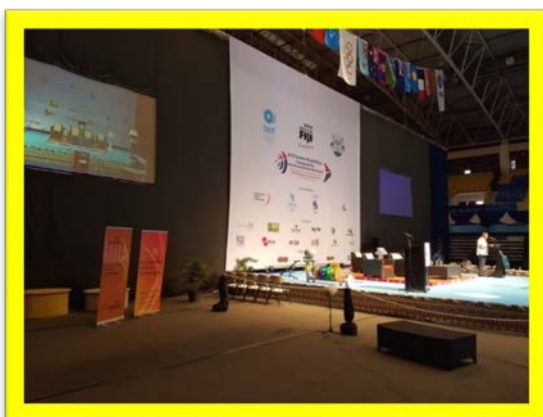
The stage at the Oceania Championships

Being an Olympic Qualification event for Rio, the competition was very fierce. A number of top lifters needed certain weights to qualify and therefore in some cases the intensity of the task at hand for some lifters became insurmountable. However, in saying this, there were some outstanding results in many categories, especially in some of the female categories.