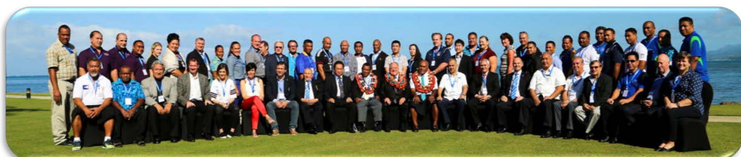
The Delegates and guests attending this year's OWF Electoral Congress in Suva