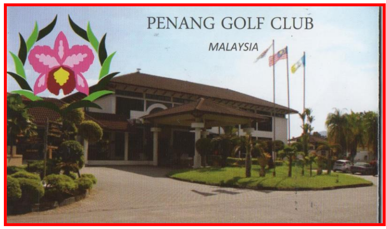
The dining hall – The Penang Golf Club adjoined next to the Equatorial hotel.