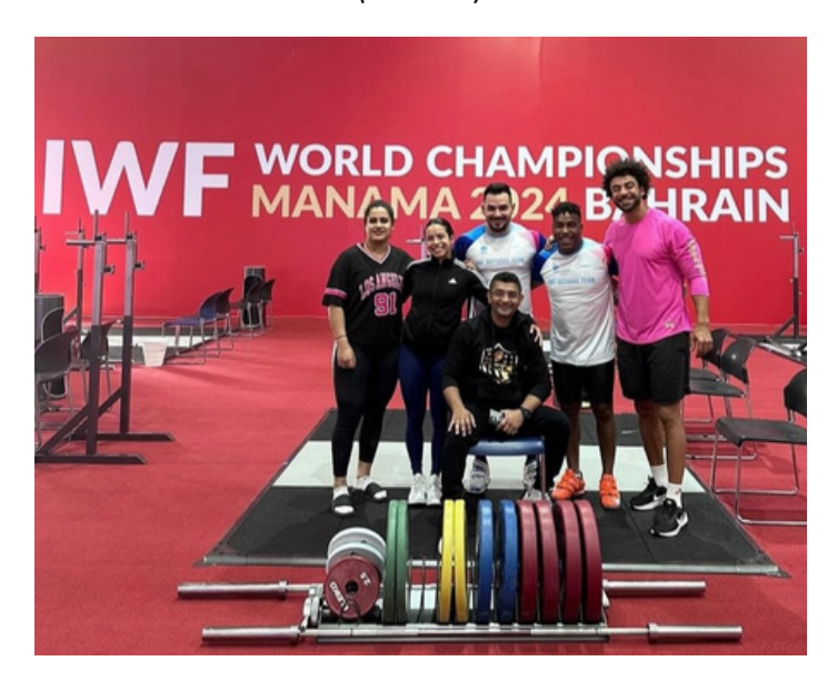
The IWF Refugee Team at the 2024 IWF Worlds