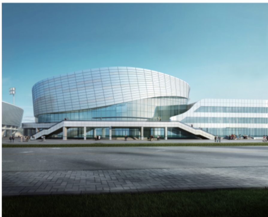
Hangzhou Xiaoshan Sports Centre Gymnasium