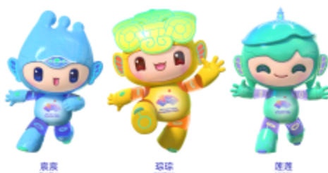
杭州2022年第19届亚运会吉祥物 The Mascots of The 19th Asian Games Hangzhou 2022

culmination of cultural and economic development, so much so that they agree with the character of Hangzhou and proudly join the ranks of the emblem and slogan of the 19th Asian Games Hangzhou 2022. The three mascots are named Chenchen, Congcong and Lianlian. This trio of robots will act as the envoys of the Olympic spirit, peace and friendship. Together, they are calling out to Asia and the world, inviting everyone to meet in Hangzhou for the Asian Games 2022.