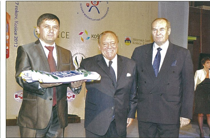
2012 YWC host Slovakia passing on the IWF flag to 2013 YWC organiser, Uzbekistan