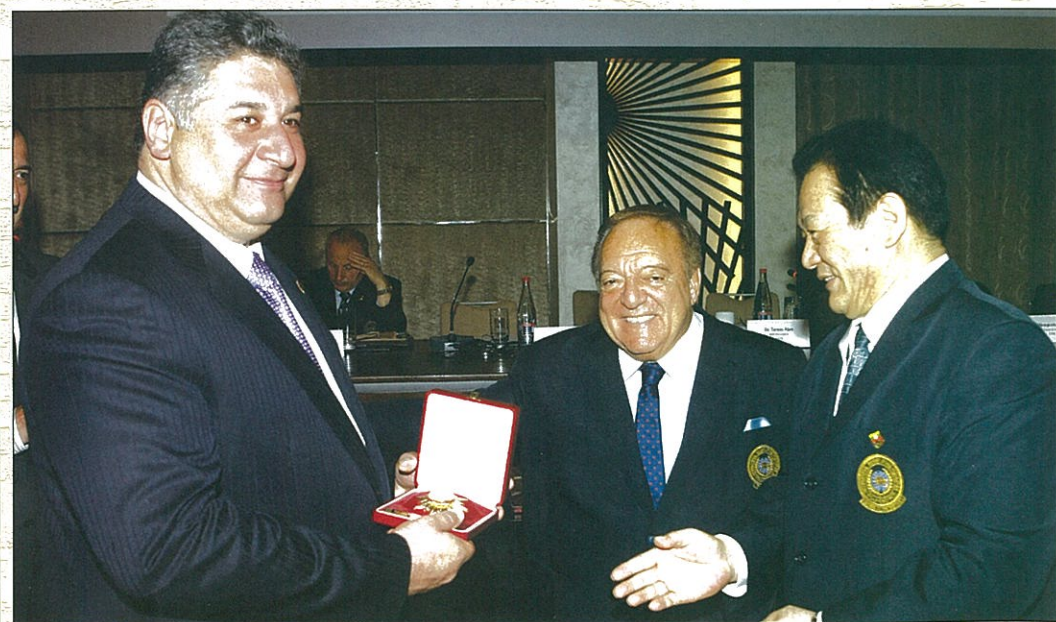
The IWF expressing its appreciation to Mr Azad Rahimov, Minister of Youth and Sports of Azerbaijan

for modern governance and satisfy the requirements of transparency and rules of democracy. At the same time, we intended to restructure our statutes, leaving the principal articles in the Constitution and creating a set of By-Laws to go into details or explanations to facilitate the implementation. On the pages of this issue of World Weightlifting we shall dwell on this subject and on the Congress in detail. At