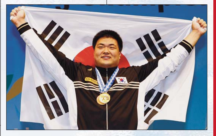
The world's strongest man in 2009: An Yong-Kwan from Korea

In the history of the world championships it happened for the first time that the same country-Korea-gave both the men's and the women's world champions in the superheavyweight category. Unknown internationally, An Yong-Kwon scored an unexpected, top favourite Olympic and world champion Jang Mi-Ran captured an expected victory for the host country. The latter's new 187kg world record is the heaviest weight ever lifted by a woman.