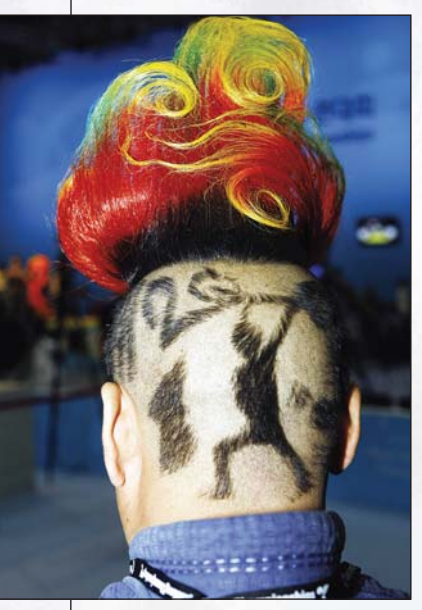
The most enthusiastic World Championships fan

rookies at senior world championships. Among the ladies, out of the 133 competitors we had seen only 28 (!) in Beijing just a year ago, while 66 of them were first-timers on the world championships platform.