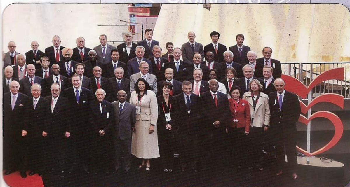
The IOC Members attending the 121 st IOC Session in Copenhagen

The Olympic Congress was embraced, before its start and after its conclusion, by the 121 st Session of the IOC.