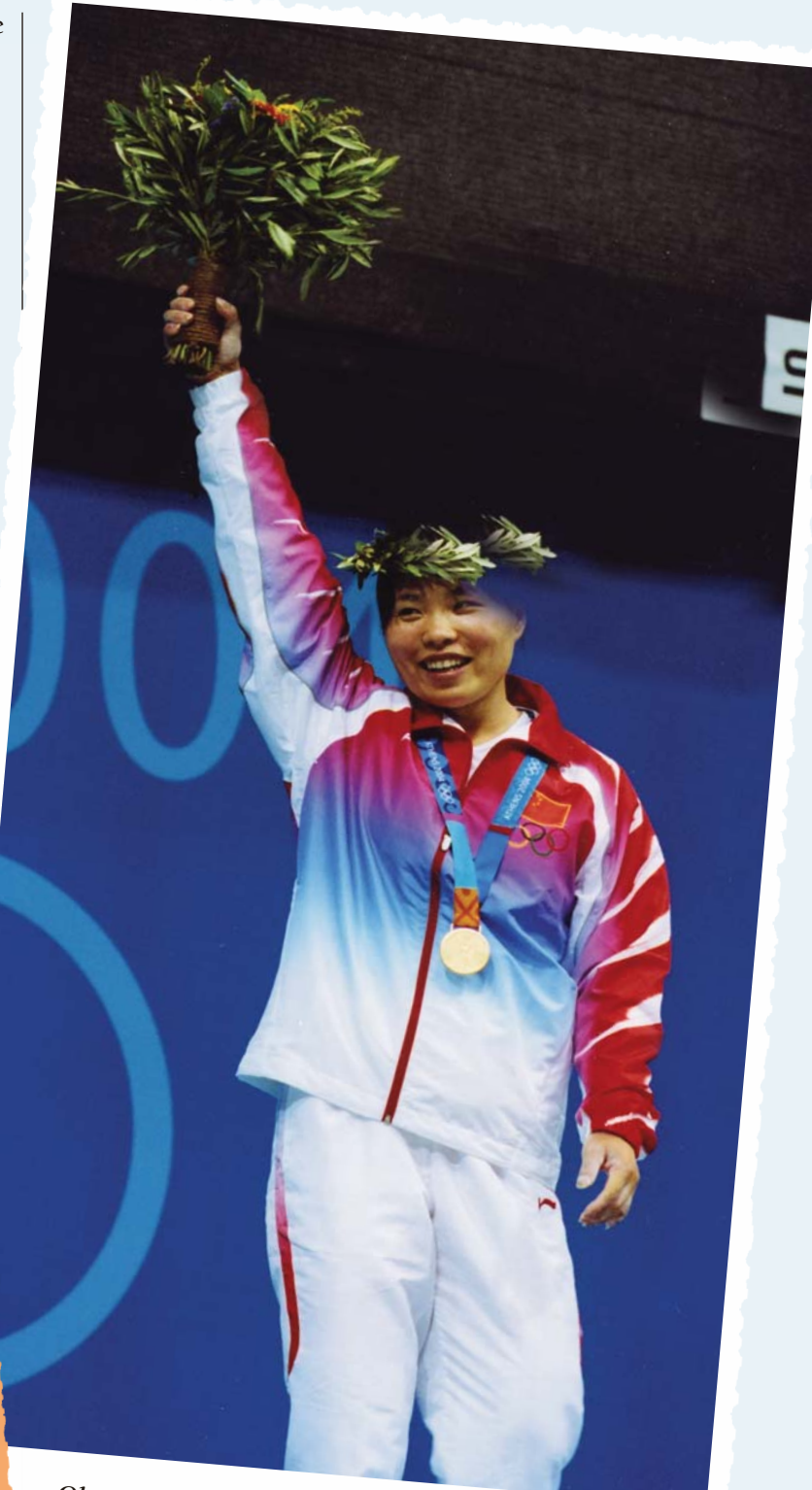
Olympic champion of 58kg, Chen Yanqing has since pinned five world records, yet she was not entered to any of the world championships