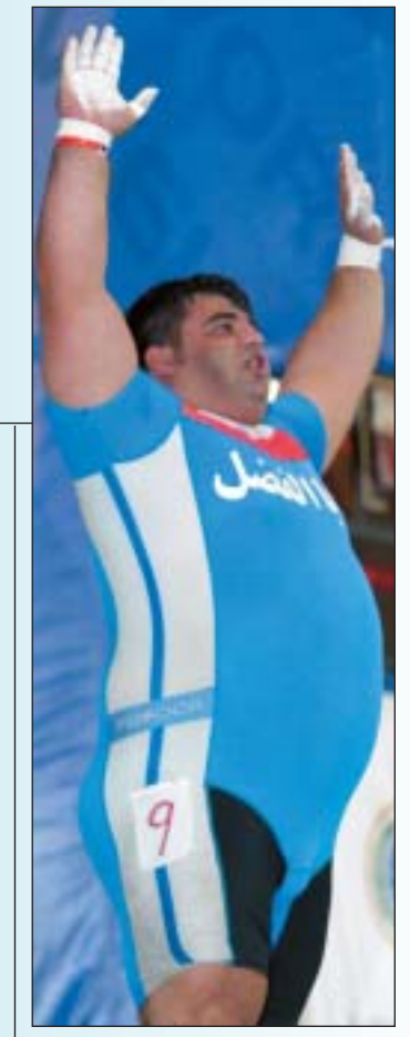
Hossein Reza Zadeh, IRI defended all his titles with ease

Defending Olympic Champion, Chen Yanging established 5 new world records during the 2006 Asian Games and as such, raised the bar to unpassed heights in the women's 58kg category. Ilin reconfirmed his status as favorite in the 94kg category in the